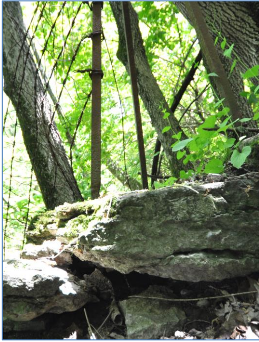
Here is the upstream pier corner.