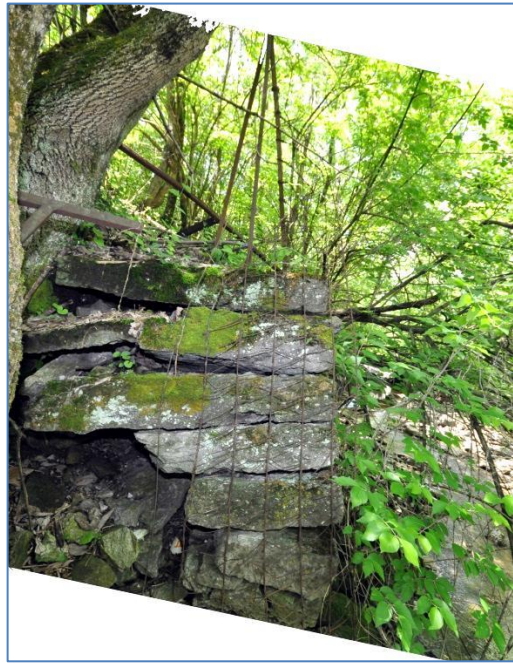
Here is the downstream pier corner.