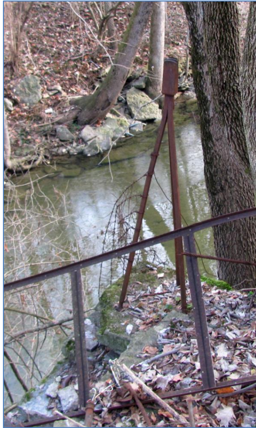
This tripod was rescued for the Mt. Healthy Historical Society on the 12th of December in 2014.